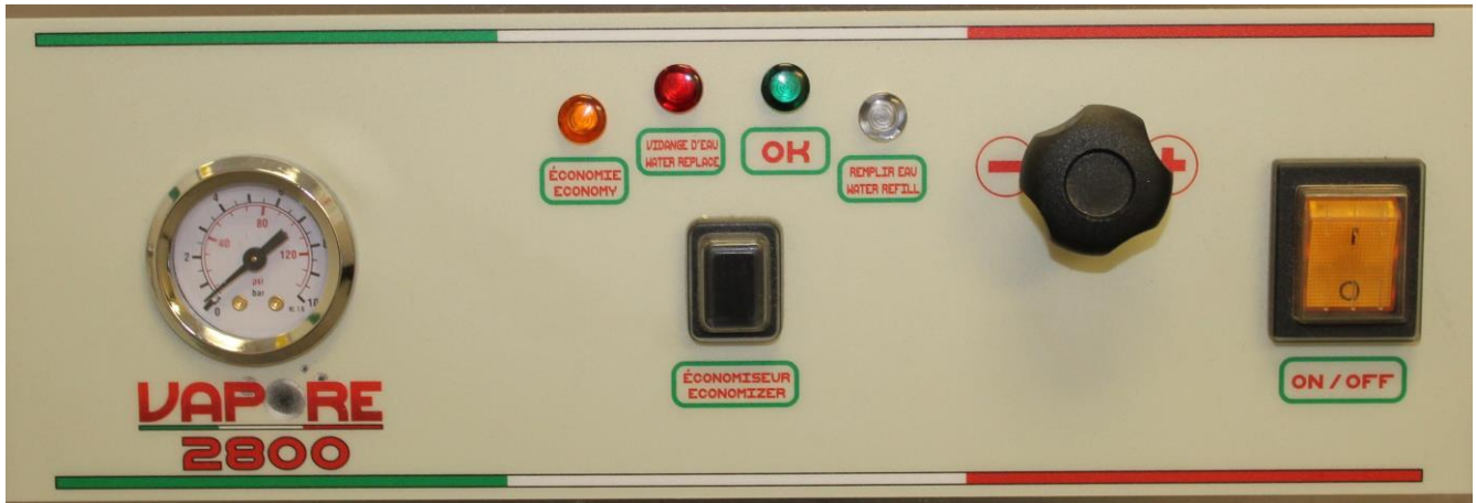
Figure 1- Control Panel